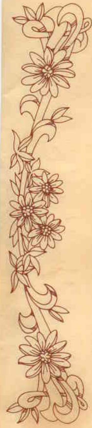
Tube 3 blue outlines